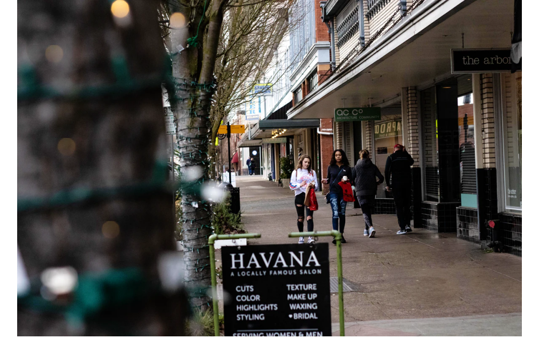
Shoppers walk along State Street in downtown Salem.

Update 6:40 p.m.: The original article has been updated to include more information.